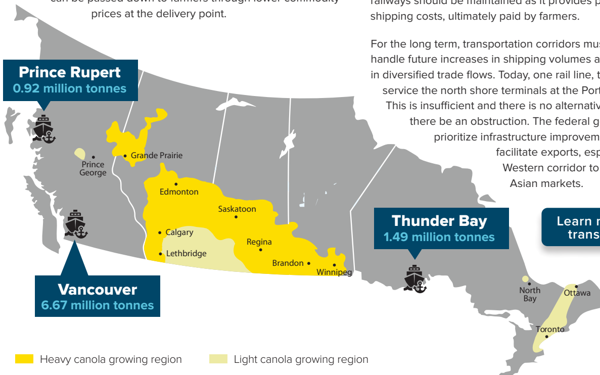
Approximate 5-year average of seed exports from port (2018-2023 Crop Years) Canadian Grain Commission

facilitate exports, especially through the Western corridor to supply growing Asian markets.